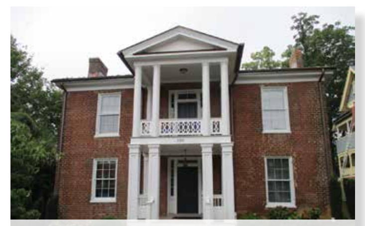
Hopkins House (mid-1840s) Classical Revival exhibits white as single trim color and doors painted an accent color.