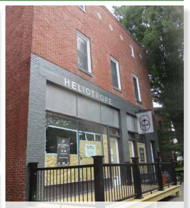
May - HLF façade grant helps with facade improvements to Heliotrope Brew Pub soon to open on S. Main Street.