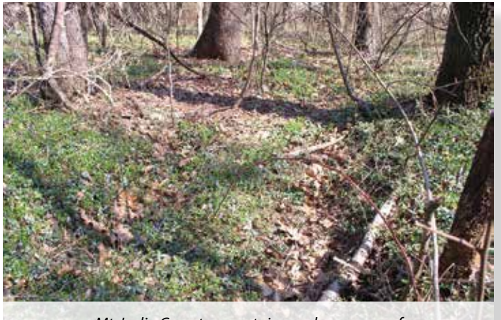
Mt. Lydia Cemetery contains sunken graves of former Buffalo Forge slaves.

If you would like to help in this statewide effort to document slave dwellings, cemeteries, and other slave sites, please contact HLF with information on Rockbridge slave sites or an expression of how you might be able to assist in this effort.