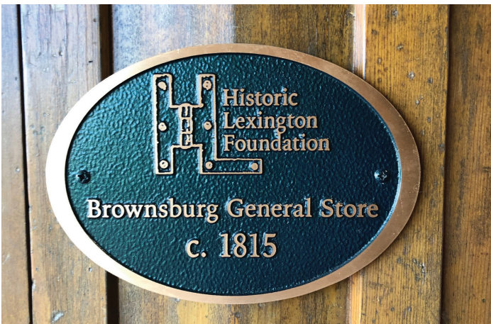
The HLF Annual Meeting reception was hosted by the Brownsburg General Store.

restore the church. He also noted there is still much restoration work to do at the church itself, the adjacent parsonage, and the affiliated cemetery.