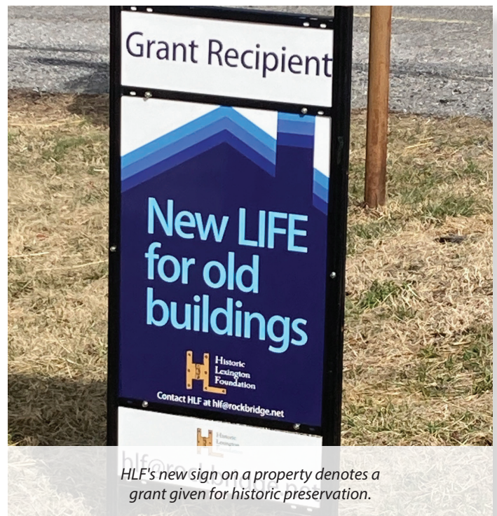
HLF's new sign on a property denotes a grant given for historic preservation.

Application forms for the Community Microgrant Program can be downloaded from the HLF website at www.historiclexington.org . For additional information about this and other HLF grant programs, homeowners should contact HLF by phone at 540.463.6832 or by email at hlf@rockbridge.net .