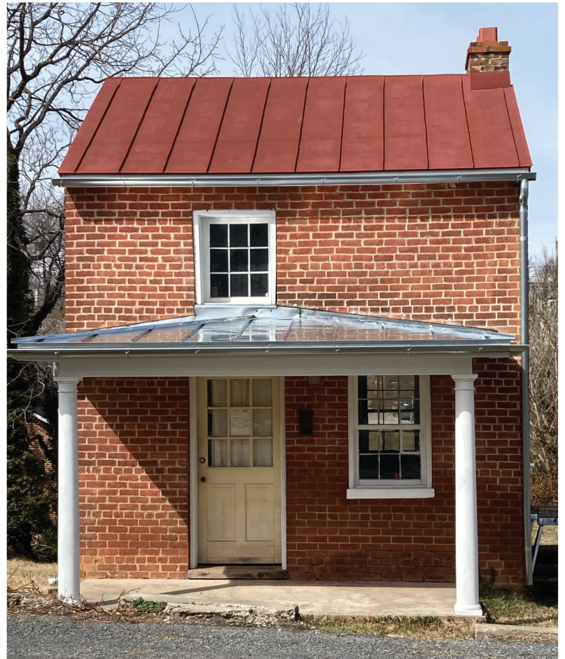
The c. 1871 Jefferson Shields House, a Lyle-Simpson Grant recipient.