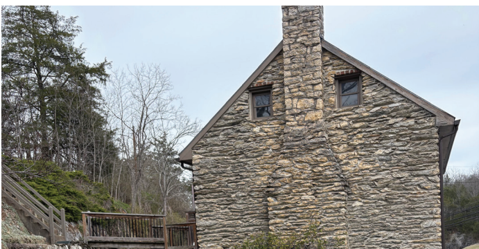
Thank you to our donors for their fundraising gifts for HLF's preservation of the c. 1780 Stonehouse.