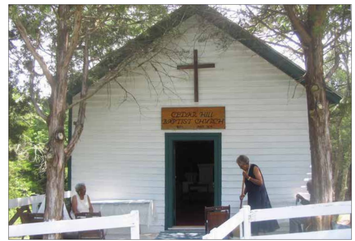
Cedar Hill Baptist Church: n.d.

DH: First Baptist of Lexington? On Main Street?