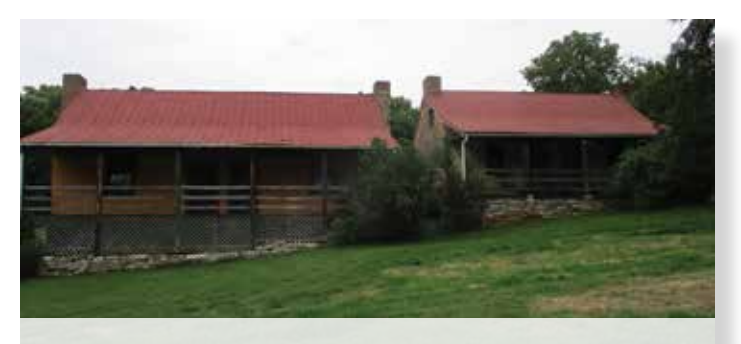
Buffalo Forge slave dwellings can be visited following Charles Dew's presentation on May 28.