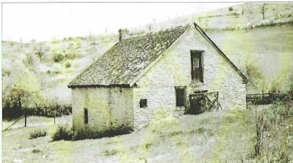
The Stillhouse at Willson Farm, also called Tuckaway, has now been completely demolished.

Rockbridge Historical Society / Washington and Lee University