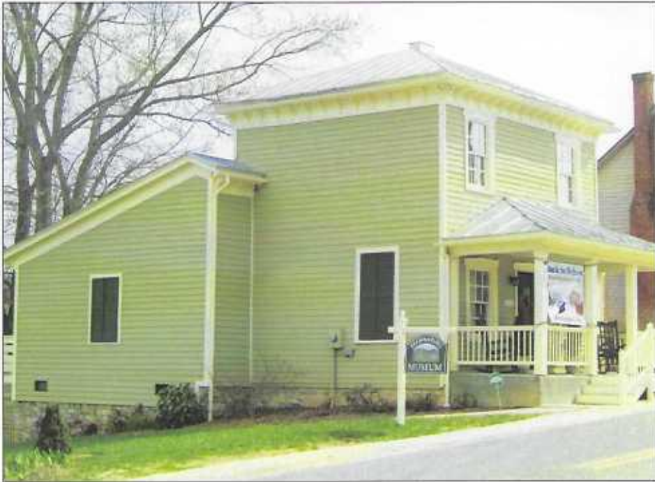
This late-1800s frame house in Brownsburg was preserved and, in 2009, became the Brownsburg Museum.

On the 50th anniversary of its founding, Historic Lexington Foundation (HLF) announces the establishment of the Lyle-Simpson Preservation Fund. The fund encourages property owners to preserve architecturally and historically significant sites, structures and objects in Rockbridge County, Virginia, including the cities of Lexington and Buena Vista.