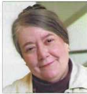
Washington and Lee University, 2006