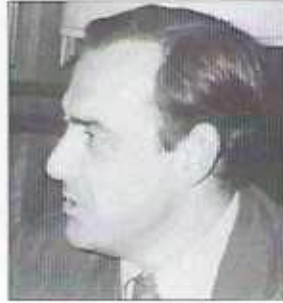
Lexington News-Gazette, 1970

Every year, historic structures are lost in Rockbridge County and elsewhere in Virginia for lack of repair and basic maintenance. Often the owners of such properties just do not have the financial wherewithal to protect those properties. Once they are gone, localities lose important reminders of the past and connections with architectural styles and people so important to the history of the locality. With this in mind, HLF has established a grant program to help property owners with their preservation needs.